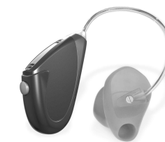
109/44 Latitude 16 Shift OptimumFit xS

Latitude™ 16 Shift™ is suitable for fitting mild to moderately severe hearing losses and can fit audiogram configurations ranging from reverse to precipitously sloping.