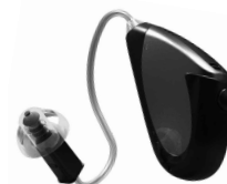
109/44 Latitude 16 Shift