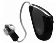
109/44 Latitude 8 Shift