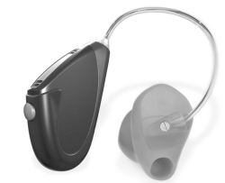
109/44 Latitude 8 Shift OptimumFit xS

Latitude™ 8 Shift™ is suitable for fitting mild to moderately severe hearing losses and can fit audiogram configurations ranging from reverse to precipitously sloping.