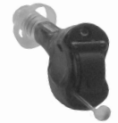
109/40 Passport Fuse

Passport™ Fuse™ is suitable for fitting mild to moderately-severe hearing losses and can fit audiogram configurations ranging from reverse to precipitously sloping.