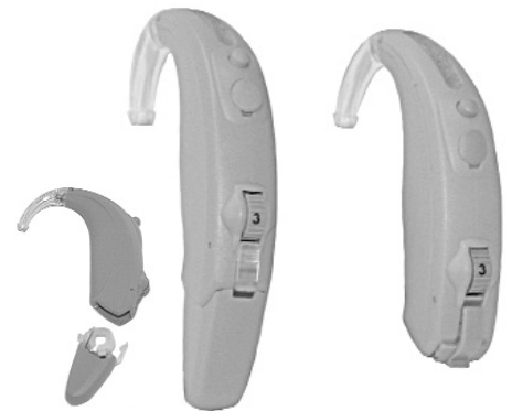
WiFi Mic - Rx wireless receiver/ digital hearing aid

Note: You can leave the WiFi Mic programming cable attached to the back of the HI PRO box so it is accessible whenever you need to program the WiFi Mic system. Simply unplug the front of the WiFi Mic programming cable from the Left or Right socket of the HI PRO box when not in use.